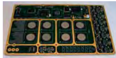
Single card implementing 8 STAP beamformers