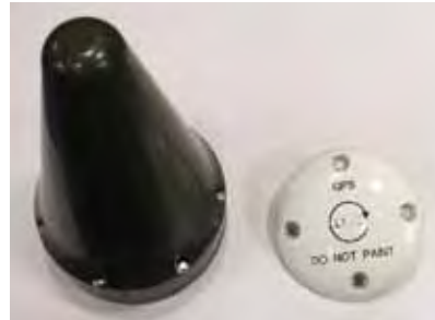
Small footprint CRPA with analogue canceller integrated into its base