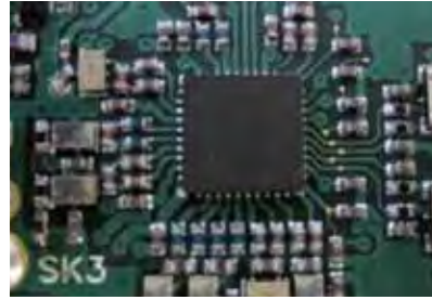
Analogue canceller implemented in an RF ASIC

We can provide feasibility studies, modelling and simulations, technology demonstrators, prototypes, product development and small volume production to meet your requirements.