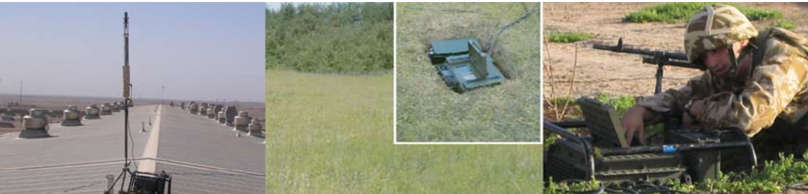
Solving target locating problems in urban areas